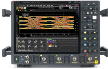
1.85 mm input model