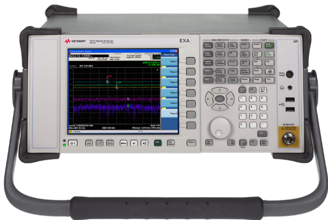
Portable configuration includes pivoting carrying handle and protective corner rubber guards (front protective cover comes standard) – N9010A-PRC