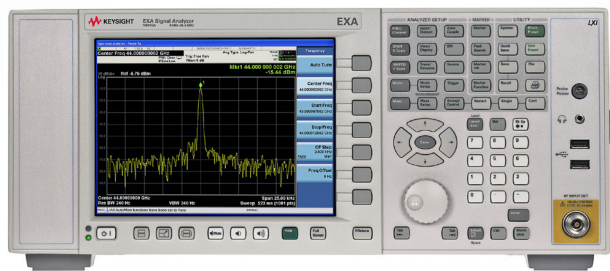
N9010A EXA bench top configuration